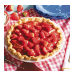
St. Boniface is planning to sell Strawberry Pies again the first weekend of June. Look for pricing and order information in the upcoming bulletins.

During May we will be pouring concrete for parking and walkways at the Monsignor JA Wagner Parish Center. This will briefly block the road entering the cemetery while it cures. We will share specific date information as soon as we can, please watch the bulletin, Facebook and the parish website for updated information. Thank you for your cooperation.